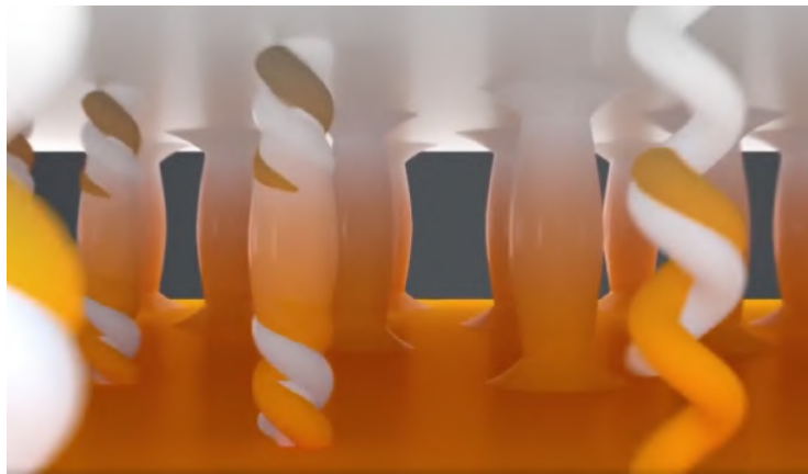
(TOP - Fusion Label, BOTTOM - Polyolefin Product, MIDDLE - “Fusion Reaction”) Simulation of Polymer Fusion Label fusing to Polyolefin Thermoplastic Product

During application, the Polymer Fusion Label and polyolefin thermoplastic product simultaneously reach melt point causing a “fusion reaction.” The result - a permanent Brand Name or Logo on plastic that cannot be lifted, separated or removed for the life of the product no matter the environment or exposure.