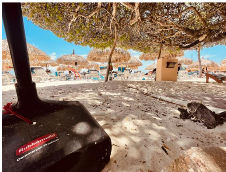
Polymer Fusion Technology label printed and fused to LSE dustpan and still building Brand Image for Rubbermaid® Commercial on this Aruban beach after several years.

*Polymer Fusion Labeling is fully recyclable with polyolefin thermoplastic products at end of life use.