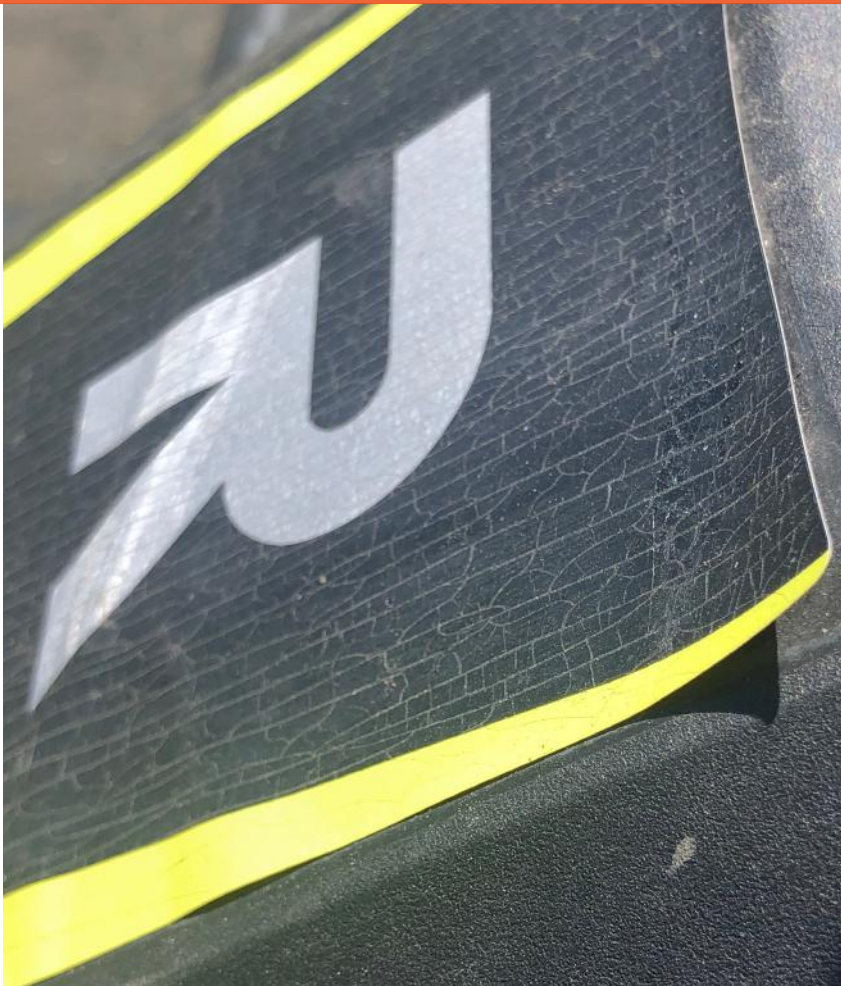
Failing adhesion-based durable Brand Recognition label applied to brand new Ryobi Brand LSE Plastic riding lawn mower component.

For Brand Labeling on LSE Polyolefin Thermoplastics